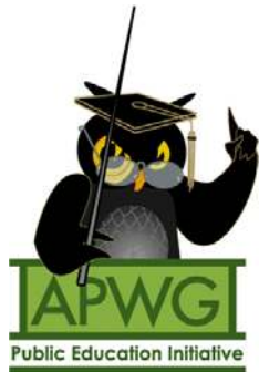
Figure 2: The Landing Page provides a clear warning and relevant safety instruction, delivered the moment a user clicks on a link in a phish mail